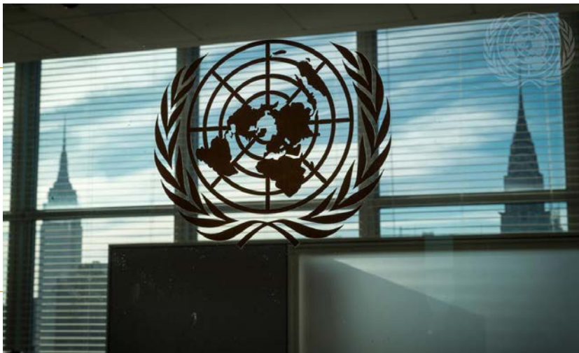
A view onto the Manhattan skyline from the United Nations Headquarters during the week of the General Assembly's annual General Debate. Silhouetted at left, the Empire State Building; at right, the Chrysler Building. 22 September 2017.

The Report of the High-level Panel on Threats, Challenges and Change, entitled A More Secure World: Our Shared Responsibility , 71 set out a broad framework for collective security for the twenty-first century. It reinforced the need for conflict prevention, protection of civilians as a core obligation of the Member States of the United Nations, field orientation, support for rapid deployment, and strong, accountable leadership.