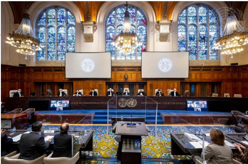
The International Court of Justice (ICJ) held public hearings (by video link) in the case concerning the Dispute over the Status and Use of the Waters of the Silala (Chile v. Bolivia) at the Peace Palace in The Hague, started on 1 April 2022. 4 April 2022.