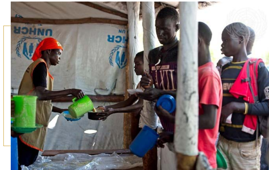
The United Nations Refugee Agency (UNHCR) and partners opened a new settlement area in Arua district, northern Uganda, in February 2017, to host thousands of refugees arriving from South Sudan. The new Imvepi settlement was opened after the Palorinya settlement reached its refugee-hosting capacity. 19 June 2017.

The essential planning factor for United Nations peace operations is the assurance of support from Member States in providing human and other resources to support the mission. Mutually agreed-upon understandings, which include memorandums for deployment and reimbursement 63 between the Secretariat and troop- and police-contributing countries, are essential for the joint planning and execution of peace operation policies and strategies. The Peacekeeping Capability Readiness System (PCRS) 64 aims to establish a more predictable and dynamic process of interaction between United Nations Headquarters and Member States and strengthen the timely and quality deployment of peace operations capabilities.