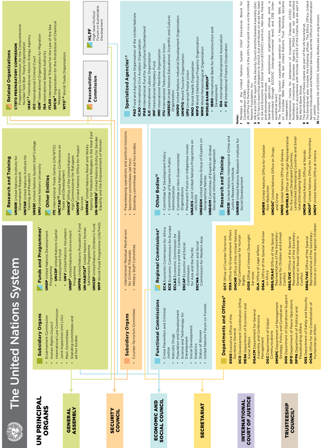
Figure 1-1: The United Nations System

Source: United Nations, "The United Nations System", July 2021. Available from: < https://www.un.org/en/delegate/page/un-system-chart >.