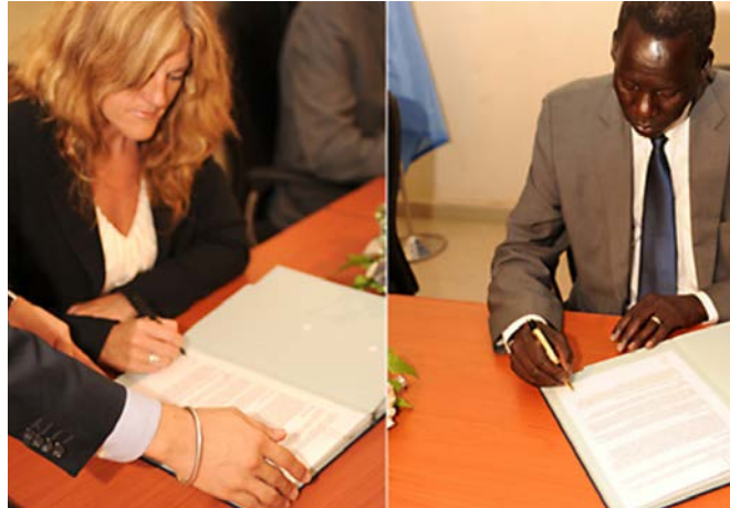
South Sudan and UNMISS sign Forces Agreement. 8 August 2011. Watch the signing of the agreement here: < https://www.unmultimedia.org/avlibrary/asset/U110/U110809e/ >.

The SOFA entailed commitments by both parties, South Sudan and UNMISS (established on 8 July 1996 by Security Council resolution 1996 (2011) i and which called for a military component of approximately 7,000 troops that took effect the day following South Sudan's declaration of independence). Under the SOFA, the government of South Sudan agreed to the conventions on the privileges and immunities related to in-country United Nations peace operations personnel, based on the 1946 Convention on the Privileges and Immunities of the United Nations . ii