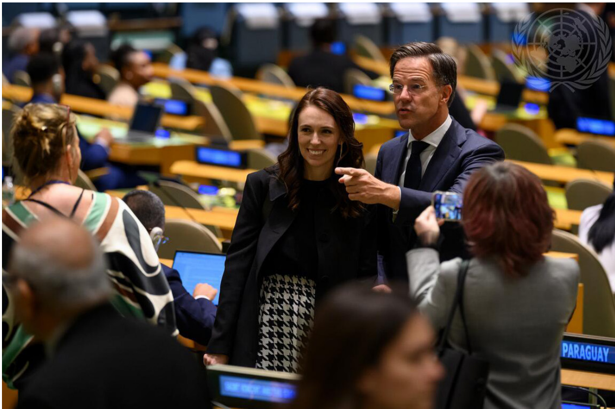
Mark Rutte (centre right), Prime Minister of the Netherlands, speaks with Jacinda Ardern (centre left), former Prime Minister of New Zealand, in the General Assembly Hall during the high-level week of the seventy-seventh session of the United Nations General Assembly. 23 September 2022.