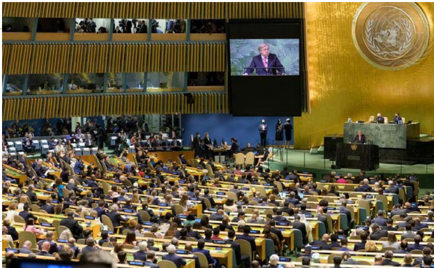
A wide view of the General Assembly Hall as Secretary-General António Guterres (at podium and on screen) addresses the opening of the seventy-seventh session of the General Assembly Debate on the theme: "A watershed moment: transformative solutions to interlocking challenges". 20 September 2022.

The Secretary-General is the "chief administrative officer" 19 of the organization appointed by the General Assembly on the recommendation of the Security Council for a customary five-year, renewable term, which traditionally has a two-term limit. The Secretary-General is a symbol of the organization's ideals and an advocate for all the world's peoples, especially the poor and the vulnerable.