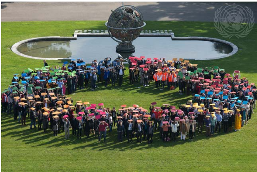
Aerial group photo of staff in Geneva simulating the Sustainable Development Goals logo on United Nations Staff Day. 28 October 2016.

For more details on the Capstone Doctrine, peace operation doctrine, definitions, procedures, and policy, readers should refer to the POTI e-learning course Principles and Guidelines for UN Peacekeeping Operations . The course is available at: < https://www.peaceopstraining.org/courses/principles-and-guidelines/ >.